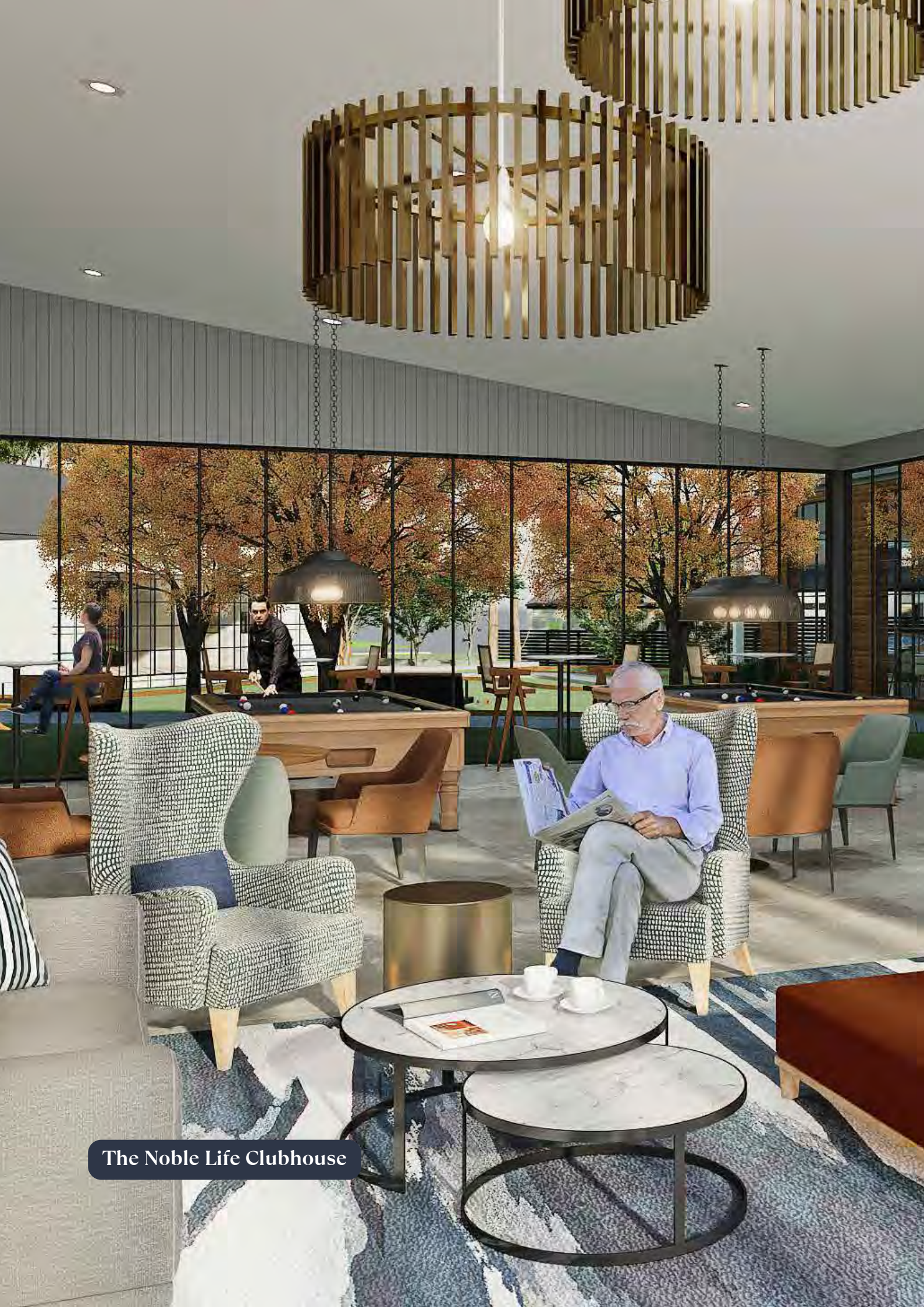
The Noble Life Clubhouse