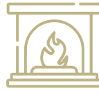
Fireplace lounge with bar and kitchen