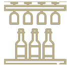
Sports lounge with bar